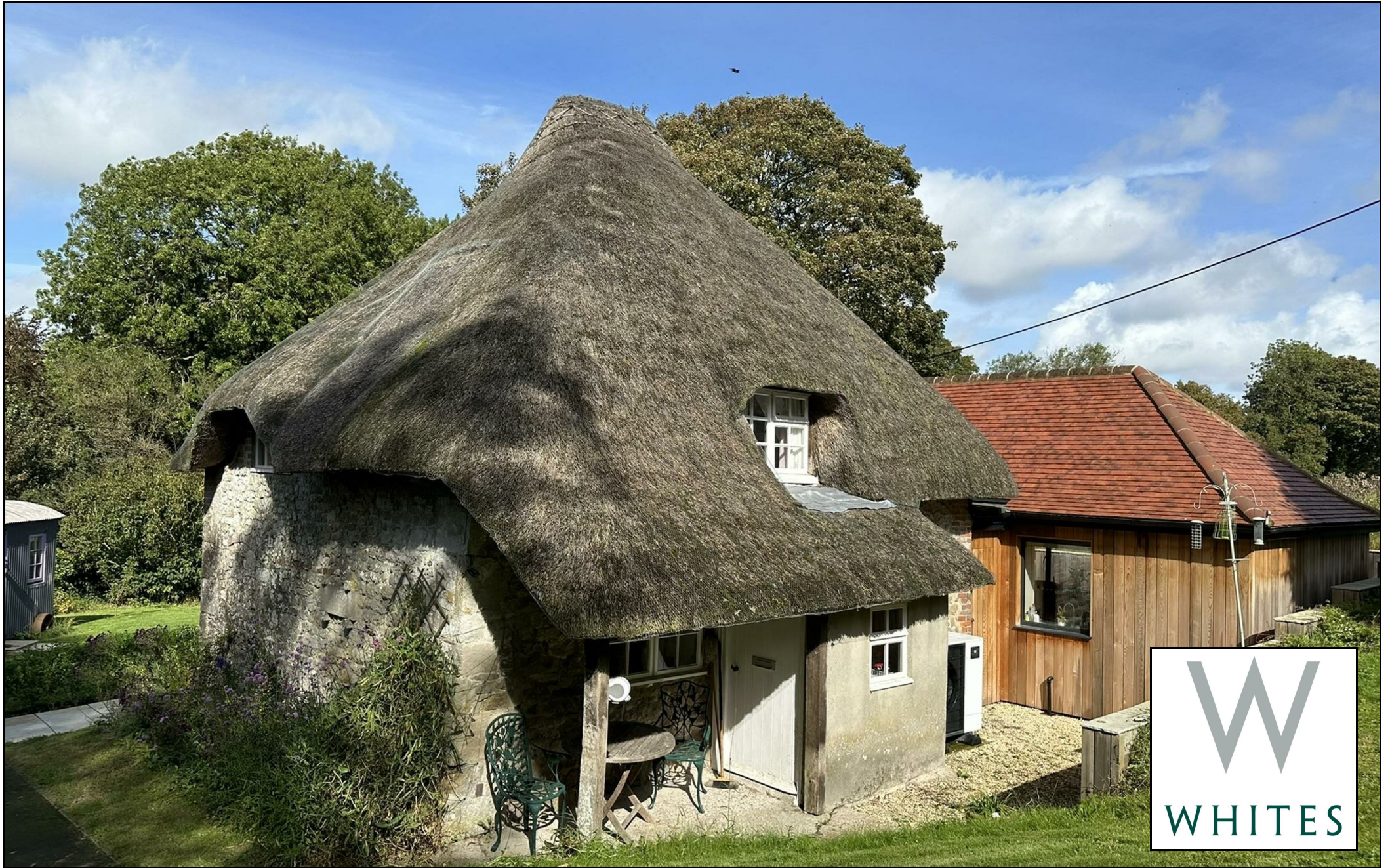
Buntings Cottage The Hollow, Ebbesbourne Wake, Salisbury, SP5 5JH